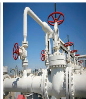
FABRICATION & PIPING