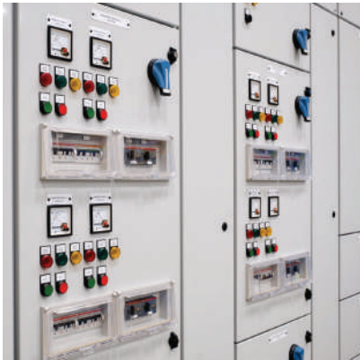
Low Voltage Panels

We are specialists in the design, build, and install of low voltage (LV) switchgear, distribution panel, electrical panel boards, and enclosure for a wide range of industries to facilitate sub-distribution and final distribution requirements.